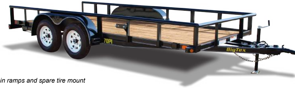
Shown with optional slide-in ramps and spare tire mount