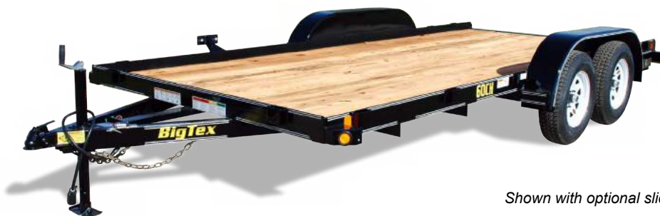
Shown with optional slide-in ramps and spare tire mount