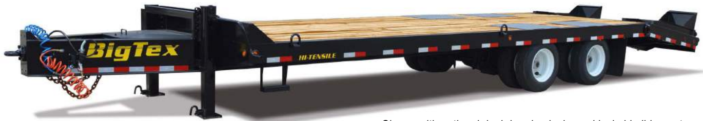
Shown with optional dual drop leg jacks and lockable lid over tongue