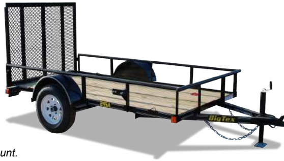
Shown with optional rampgate and spare tire mount.